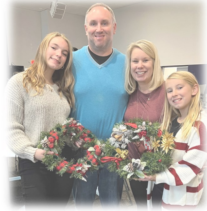
Advent Wreath Making Party and Wesley Center decorating last Sunday!