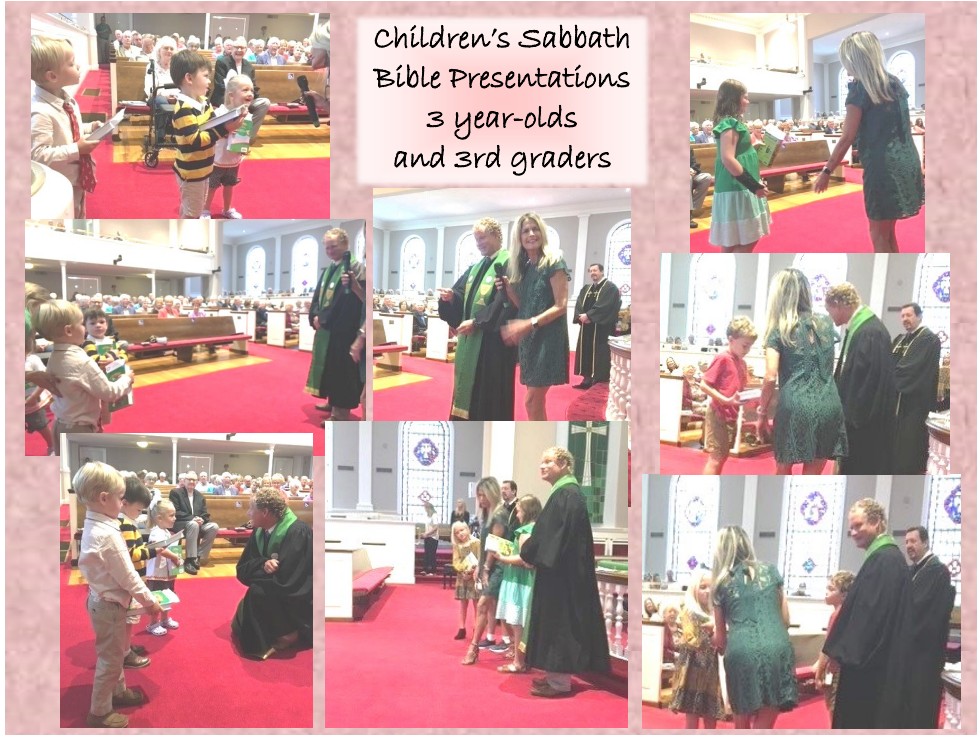
Children's Sabbath Bible Presentations 3 year-olds and 3rd graders