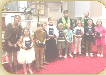
3rd grade & 3-yr old Bibles