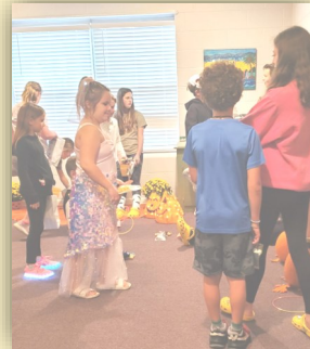
Fall Fun @ First—games!