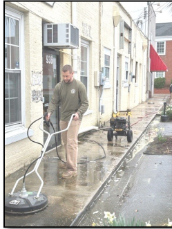
Jobs well done! Thanks, guys!

March 5: 5:15PM Youth @ N Campus March 8: 7:15AM Youth Prayer Breakfast, Chick-Fil-A March 12: 5:15PM Youth @ N Campus