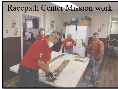
Racepath Center Mission work