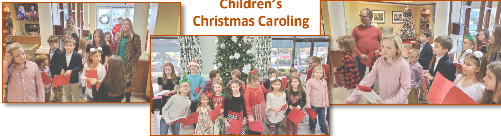
Children's Christmas Caroling