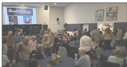
Missions Impact Weekend