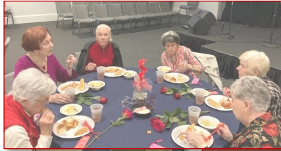
Widows and Widowers Valentine Lunch