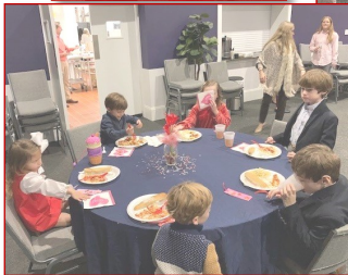
Youth Super Bowl Party & Games