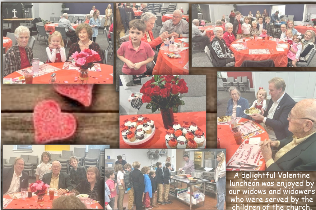
A delightful Valentine luncheon was enjoyed by our widows and widowers who were served by the children of the church.

for holiday serving, gifts to neighbors or keep frozen to enjoy later. All proceeds support UWF mission projects locally .